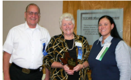
Foster Parents of the Year recognized at annual awards ceremony for their contributions.