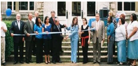
County board members host blue ribbon cutting event to raise abuse prevention awareness.